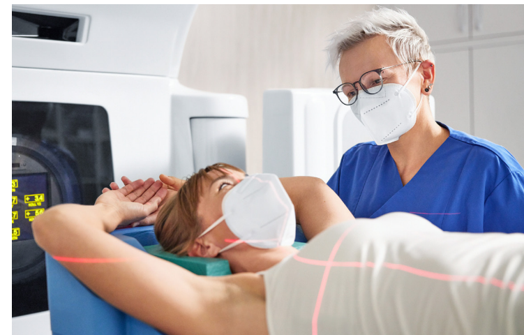
In 2022, we have treated more than 24 million patients in our clinics.

When we talk about the future of our company, about #FutureFresenius, three things will guide our thoughts and actions: a simpler corporate structure, improved performance, and a clear focus . This is why we will make a distinction between Operating Companies