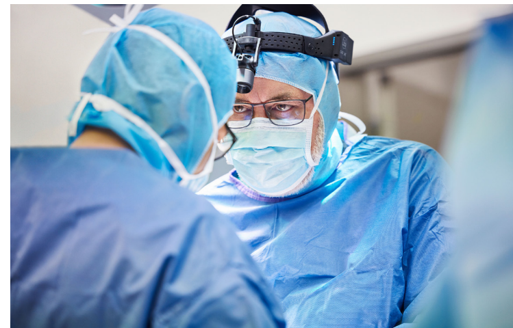
Our company has a key position at the heart of healthcare.

In February of this year, we then set a decisive course for a successful relaunch. These decisions provide Fresenius with a direction and enable the company to create sustainable value – for our patients, customers, employees, and of course for you as owners.